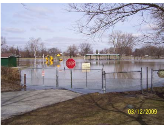
Waterloo Park Off M-50