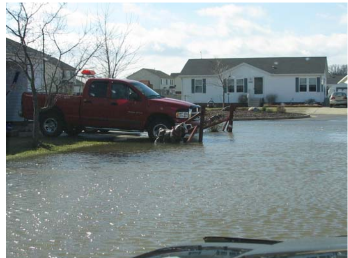
Terry KC8RQI's private flood