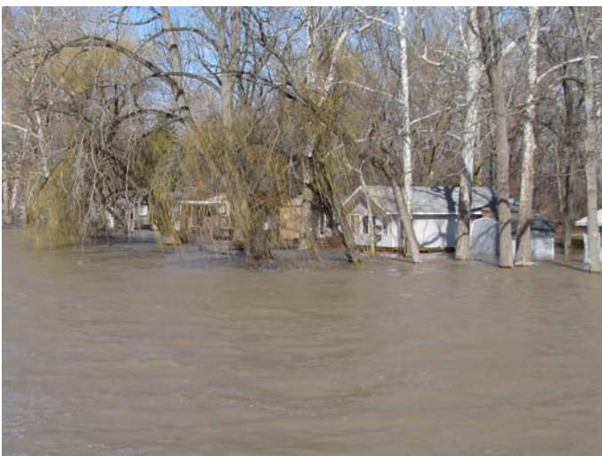
Ida-Maybee Rd Bridge