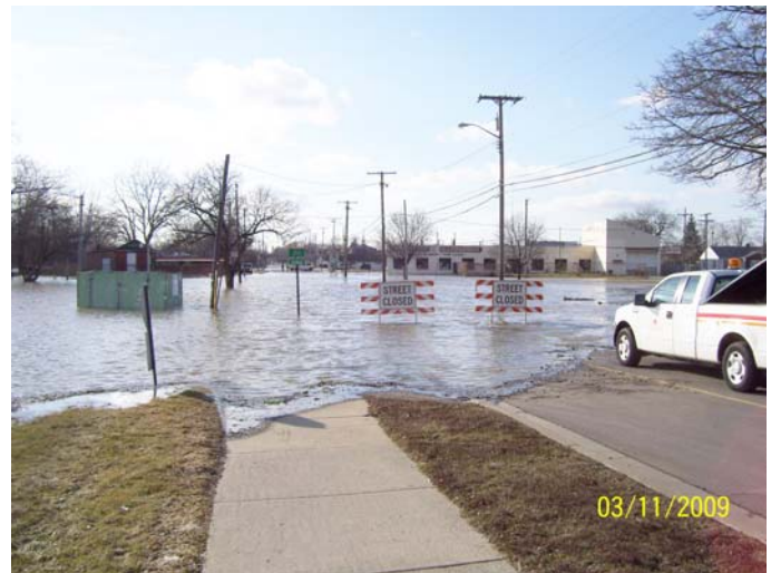
Elm Street and Telegraph Road