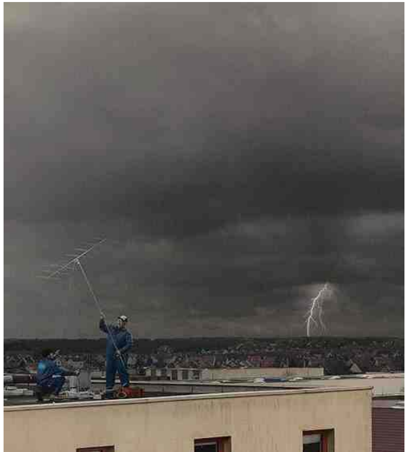
Brave or dumb?