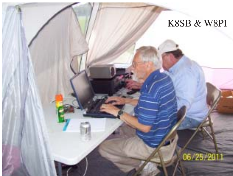
K8SB & W8PI

Now we have to start thinking of how we can do even better next year. The more members we can get to help out with Field Day, the better we can finish. Remember, even if you do not want to operate one of the stations, there are plenty of other ways to help with this extremely fun program in your club. We always need help with putting up and taking down antennas and equipment, working the public service table, showing the non-amateurs that stop by the Field Day site how amateur radio actually works, and most importantly helping with the food for the operation.