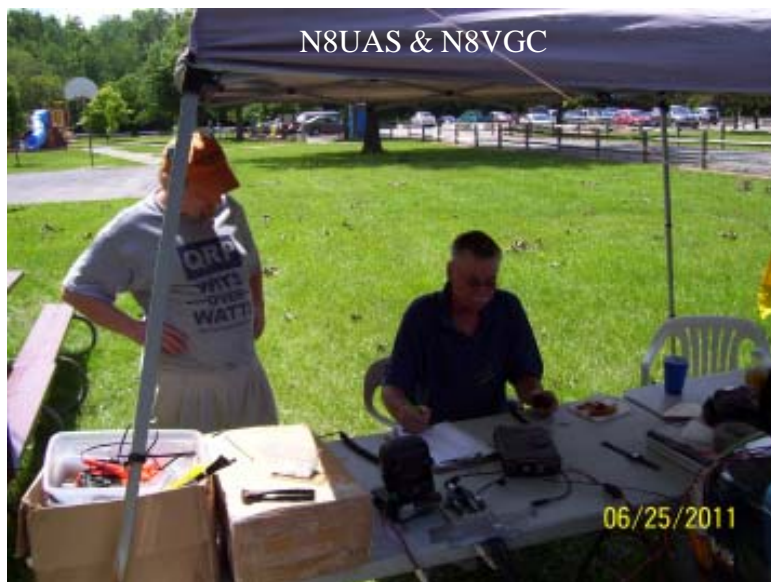
N8UAS & N8VGC

Nationally, there were 2,666 club/individual entrants in the Field Day operations, with 37,765 amateurs working these stations. In the Michigan section we had 92 stations on the air. Many of these groups had up to 14 transmitters on the air simultaneously. In the Michigan section we placed number 7 overall even against the bigger clubs with many more operators and transmitters. On a country wide basis, MCRCRA placed in the top 6 % nationally or out of the 2,666 entrants we were 172.