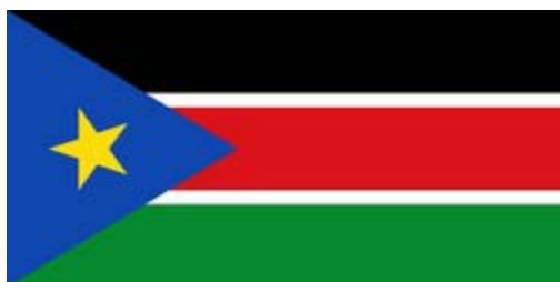
The flag of the Republic of South Sudan

The newly created Republic of Sudan was recognized by the United Nations on July 14, making it the newest DXCC entity.